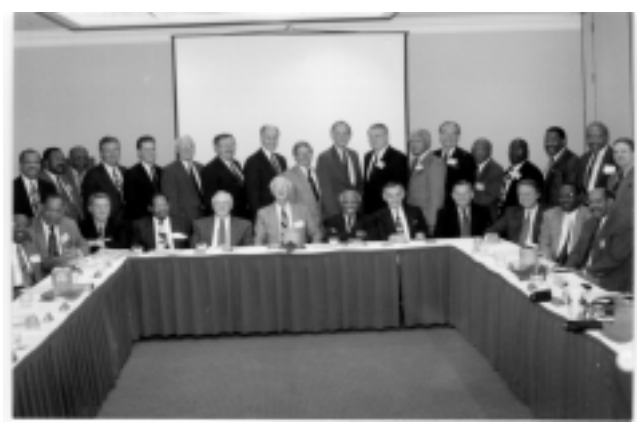
The "20/20 Meeting" of the Racial Reconciliation Dialogue.

But tragedy lurked in the midst of this triumph. The fledgling movement came under vicious attack by the secu-